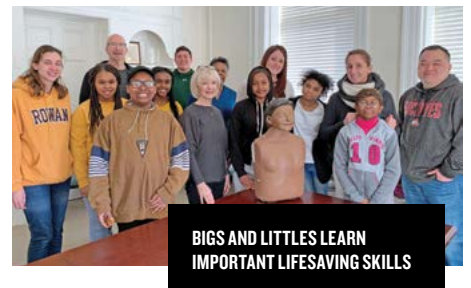
BIGS AND LITTLES LEARN IMPORTANT LIFESAVING SKILLS

Bigs and Littles spent a recent Saturday morning with healthcare professionals learning how to react during emergency situations and perform CPR. Thank you to our partners at Hackensack Meridian Health for this important workshop that can help save lives!