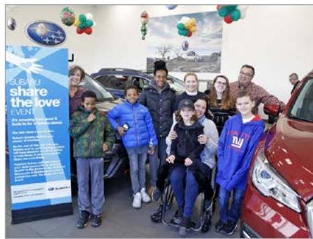
FREE lunch and cool cars to test drive!

Join in on the Freehold Subaru Share the Love Event! ♥ Test drive a great vehicle and support a great cause. With every new Subaru purchased or leased, now until January 2 nd , Subaru will donate $250 to BBBS or the charity you choose. Freehold Dodge & Subaru will donate an additional $50 to BBBS to make an even greater impact here in our community!