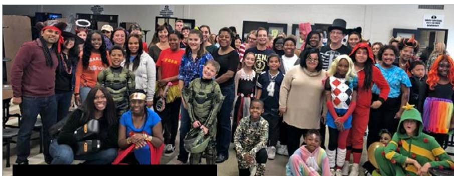
MATCHES CELEBRATING HALLOWEEN TOGETHER

Bigs & Littles enjoyed the annual BBBS Halloween party at Saint John Vianney High School where they painted pumpkins, played games, got candy, and showed off their costumes!