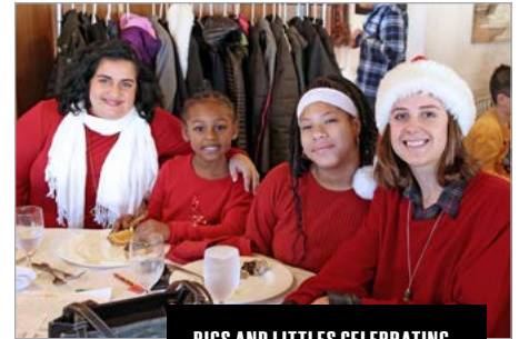
BIGS AND LITTLES CELEBRATING THE HOLIDAYS