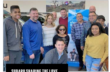
SUBARU SHARING THE LOVE

Bigs and Littles spent a special afternoon at Freehold Subaru celebrating the Share the Love Event. Buy or lease a Subaru now until January 2, and Subaru will donate $250 to BBBSCNNJ! We're honored to be the hometown charity for five years now!