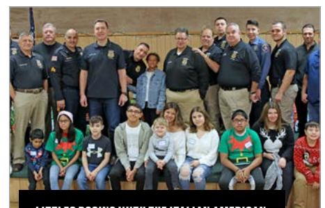
LITTLES POSING WITH THE ITALIAN AMERICAN POLICE SOCIETY OF NEW JERSEY