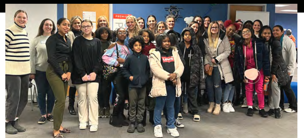
Bigs & Littles recently attended a Women's History Month event at Single Throw Marketing this month.