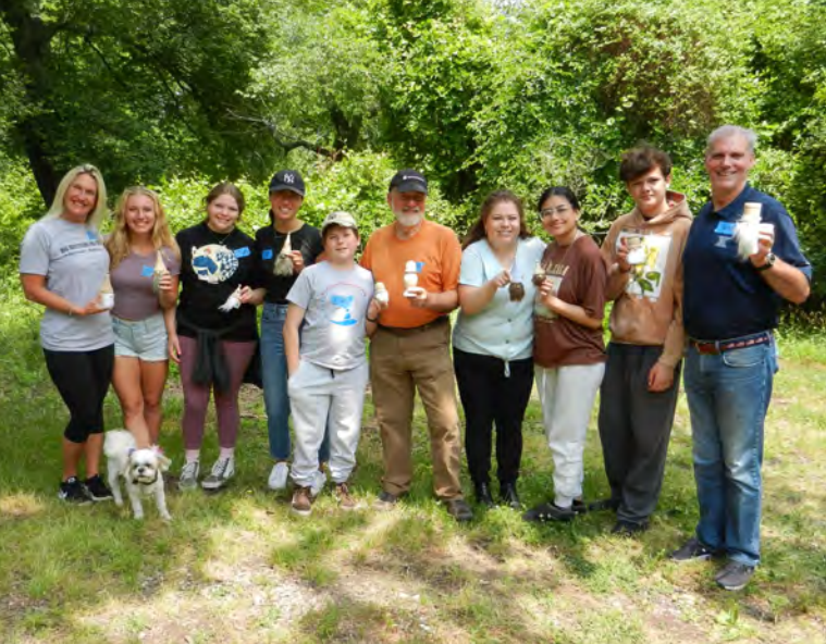
Woodturning Workshop led by Atlantic Shore Woodturners